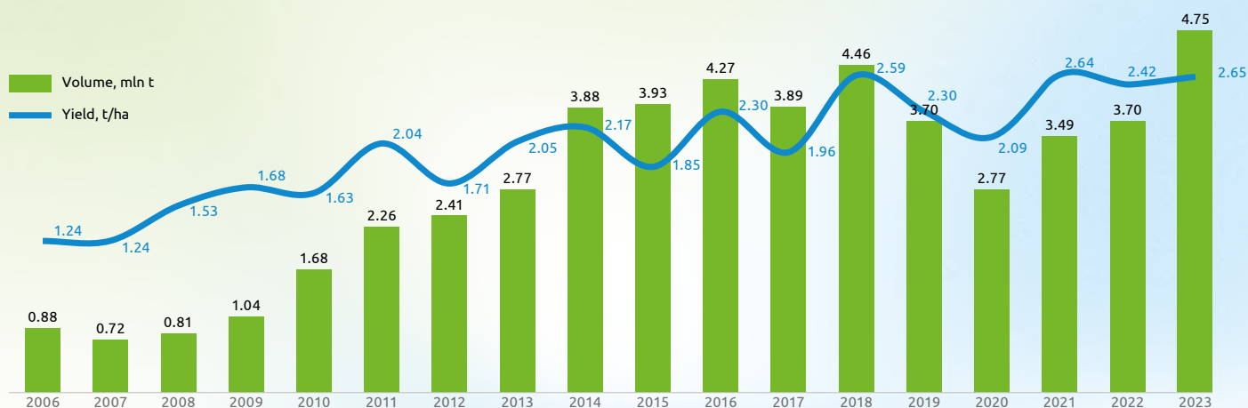
Chart. Soya production in Ukraine 2006–2023

Europe's 1 Ukraine is the largest producer of soybeans