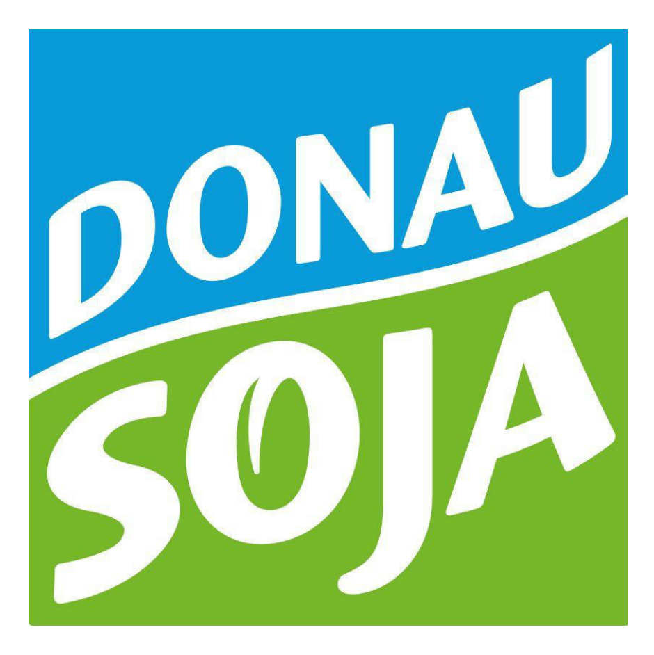
Donau Soja Guidelines