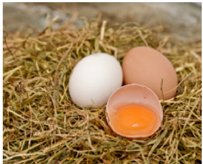
Eggs with soya from European producers

The European Union is heavily dependent on soya imports. In 2018 these amounted to almost 40 million tonnes, mainly from overseas. About 12 million hectares are needed to meet this demand – one and a half times the area of Austria! According to the Sustainable Trade Initiative (IDH), only 19% of the EU's soya consumption come from certified deforestation-free production, as guaranteed by Donau Soja. In Germany 3.6 million tons of soya are consumed annually, of which 22% come from certified deforestation-free production.